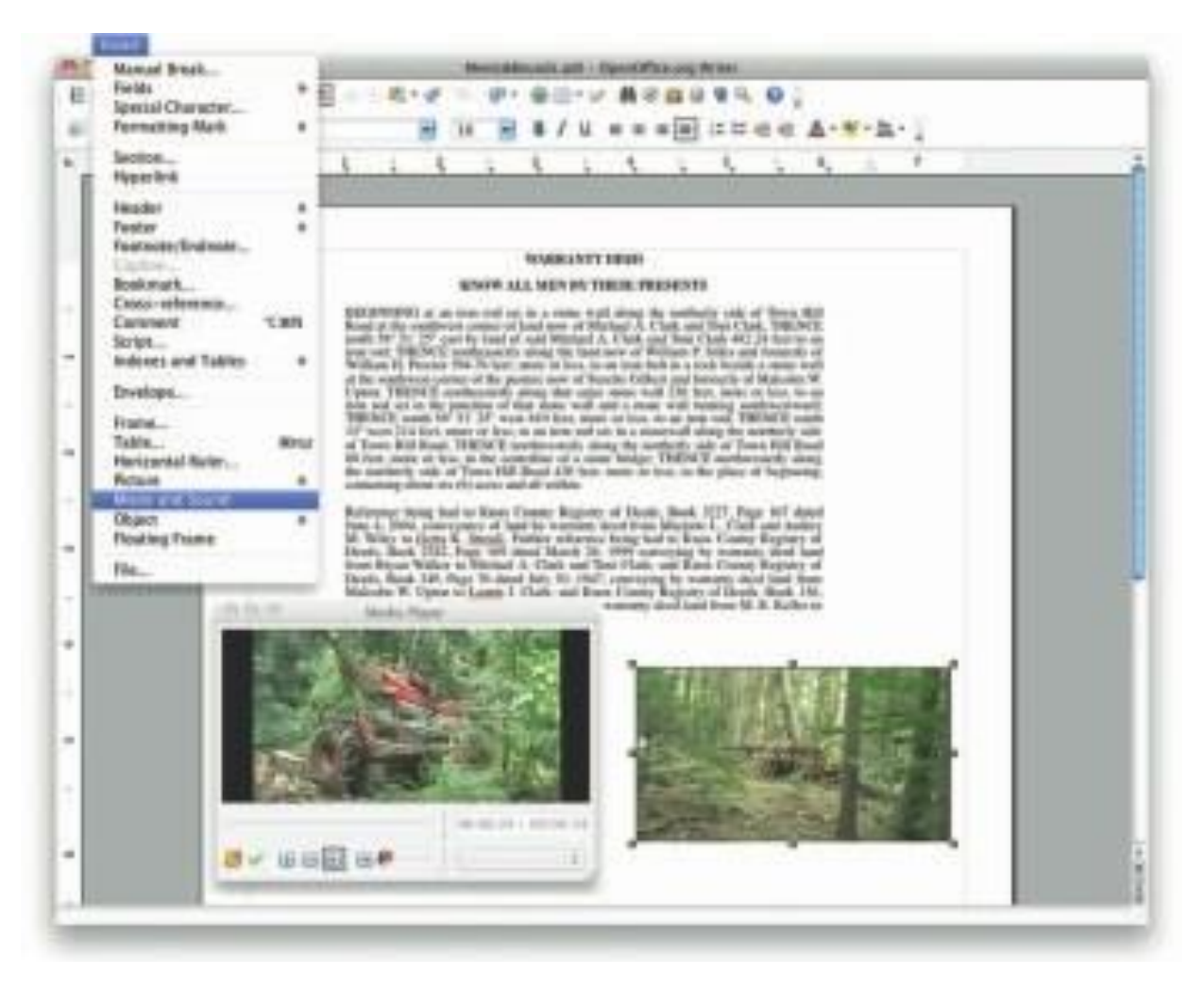
Figure 7-3 Most word processing programs allow you to include various image formats, movies, and digitized sounds (including voice annotations).